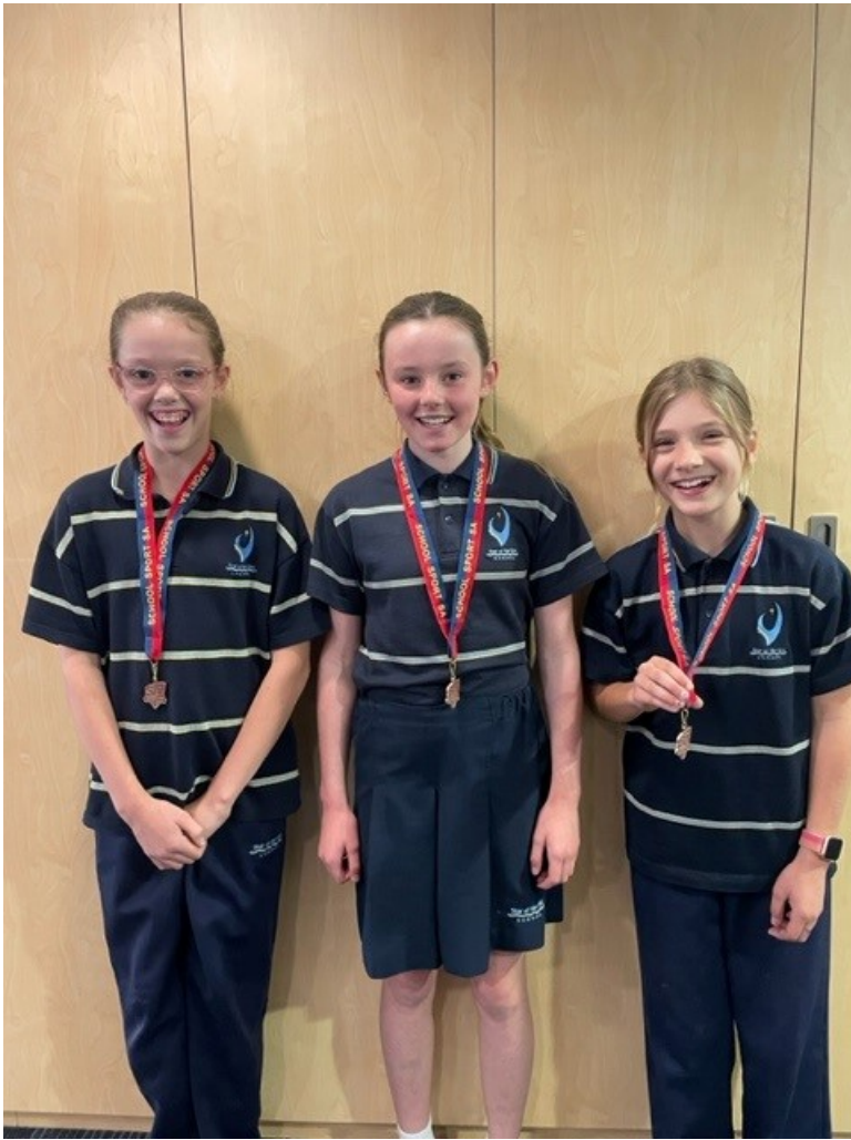
Congratulations to our Year 5-6 girls who came 3rd in the SAPSASA Mountain Bike.